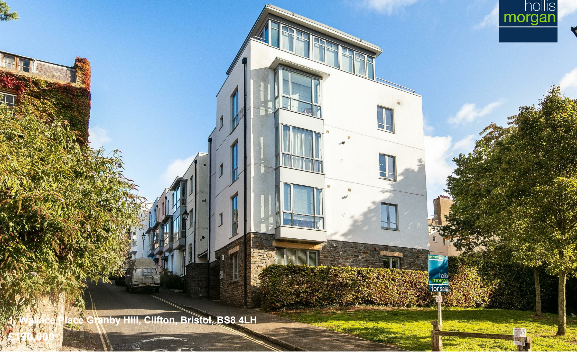
1, Wallace Place Granby Hill, Clifton, Bristol, BS8 4LH